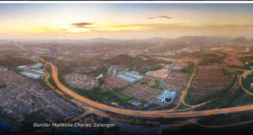
Bandar Mahkota Cheras, Selangor