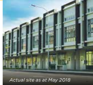
Actual site as at May 2018

This exclusive shop offices a contemporary concept that cleverly incorporates practicality and effectiveness. With its CCC obtained on 31st July 2018, these adaptable factory spaces are built to serve multiple functions such as showroom, office, production floor and storage.