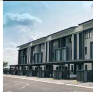
1 1/2-Storey Townvilla Actual site as at December 2018

The Vantage is a bespoke development that has garnered impressive sales. Phase 1 which includes super links, premium villas and semi-Ds are completed and ready for occupancy. Meanwhile Phase 2 has made a 100% sales just within 2 weeks of launching and obtained its CCC on 4th December 2018.