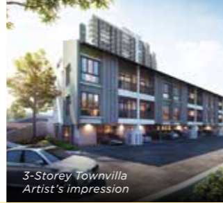
3-Storey Townvilla Artist's impression

A cul-de-sac hilltop enclave in Bandar Mahkota Cheras, this development offers urban residential excellence at an affordable price tag.