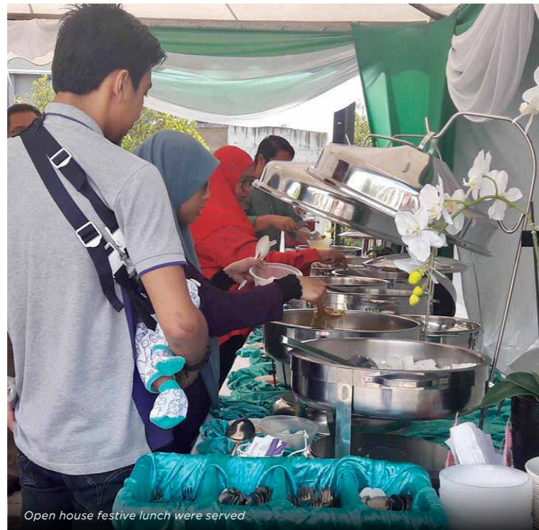
Open house festive lunch were served

Eid is a big deal and so this year, on Saturday of 2018 June 30th, we went all out and celebrated with a special Majlis Rumah Terbuka Aidilfitri Crescent Raya that features an array of delicious festive treats and delicacies as well as an unbeatable home package plus the chance to win travel packages worth up to RM10,000.