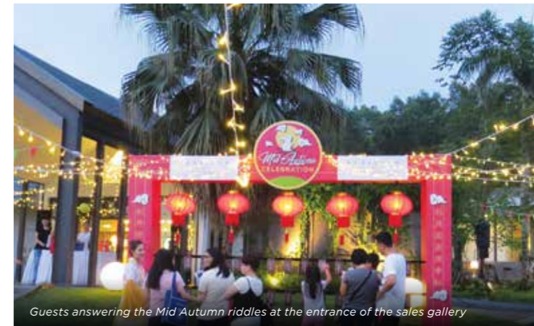
Guests answering the Mid Autumn riddles at the entrance of the sales gallery

The Resilion Residence Mid-Autumn Celebration on the 22nd and 23rd of September 2018 was a family fun filled 2-day event. Crowd came and clamoured around the various food trucks parked for the festivities. Other attractions include workshops that kept kids occupied as well as an extravagant Insta-worthy Luminous LED Swings Garden that kept shutterbugs busy with OOTDs. Special property packages were also offered during the festival.