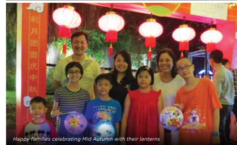
Happy families celebrating Mid Autumn with their lanterns