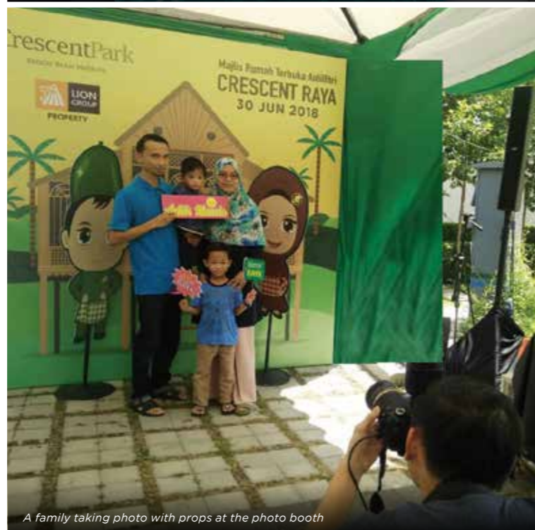
A family taking photo with props at the photo booth