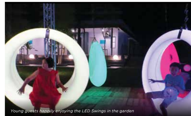
Young guests happily enjoying the LED Swings in the garden