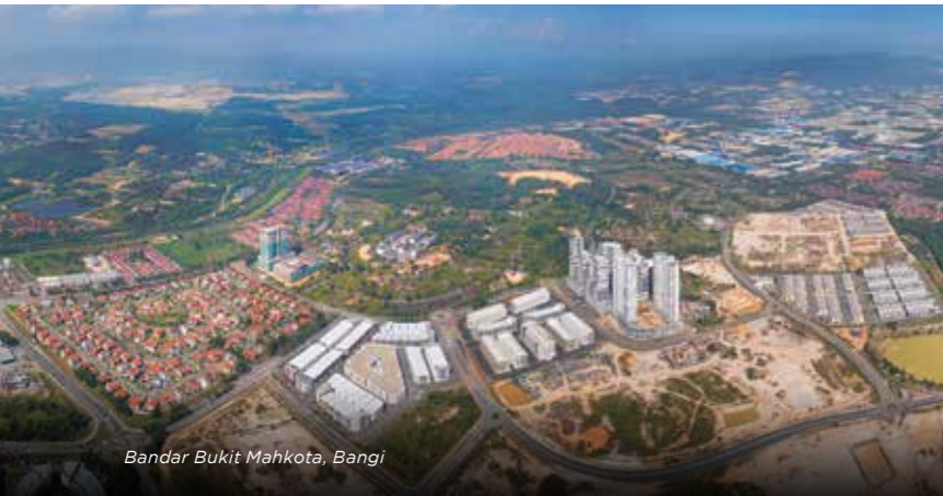
Bandar Bukit Mahkota, Bangi